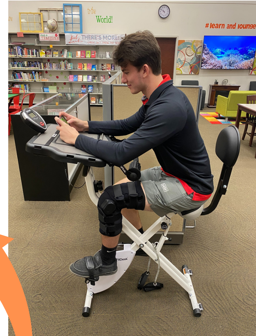
Read & Ride