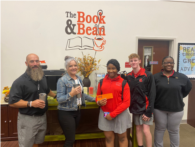
Book & Bean